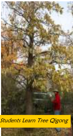
Students Learn Tree Qigong

will be highly energetic and is for the beginning to advanced practitioner to improve their health & awareness. If you are an advanced student we will work with you so please attend.