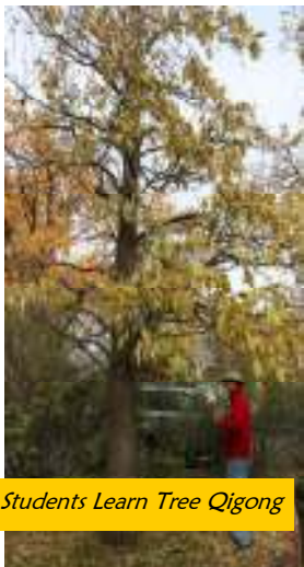
Students Learn Tree Qigong

will be highly energetic and is for the beginning to advanced practitioner to improve their health & awareness. If you are an advanced student we will work with you so please attend.